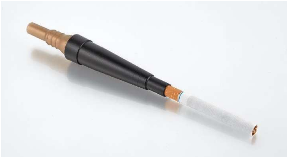
Figure 4: Filter use for cigarettes.

The cigarette has to be placed in the black colored part of the filter as depicted in figure 4 .