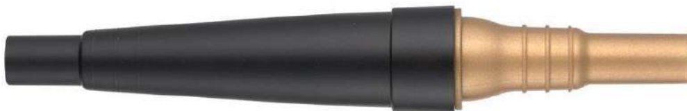
Figure 2: Shair filter

The filter material is a non-hazardous inorganic-based material which adsorbs the carcinogenic tar components. Single use is recommended for shishas, because the average amount of tar-like components coming of the tobacco in a single shisha smoking session is 40-70 times that of a single cigarette (600 mg on average) [1].