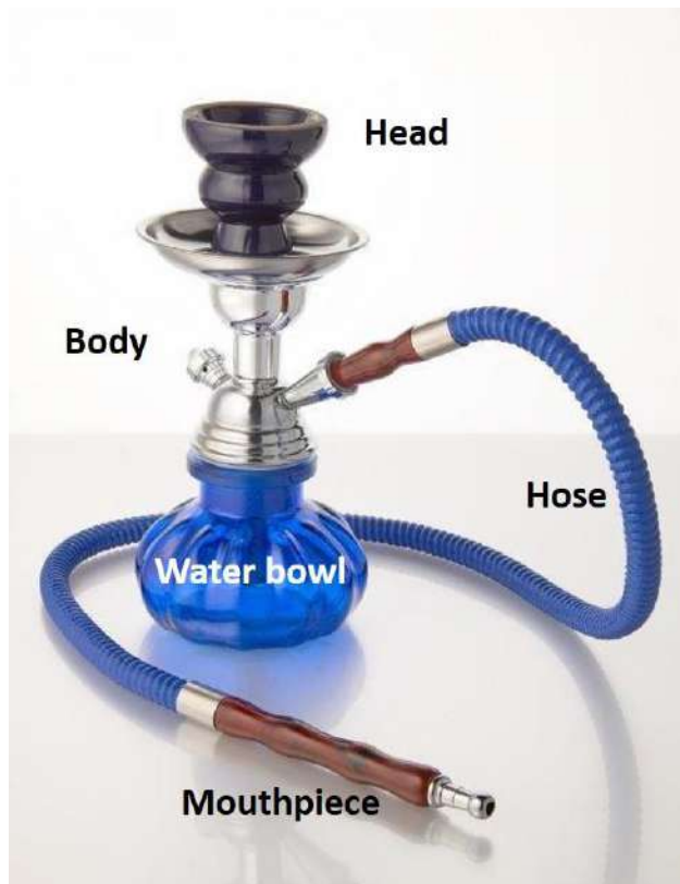
Figure 1: A typical waterpipe/shisha.

One of the most spread myths about shisha smoking is that it is a healthier way of smoking compared to cigarettes and cigars, for example. This is a very wrong assumption, on the contrary, there are much more hazardous components (in numbers and amount) present in shisha smoke than in cigarette/cigar smoke. Many studies have been conducted on the relation of health and regular shisha use and all state the same: 'regular shisha use leads to worse health, higher risk of various cancers and other diseases, like periodontal disease.' Thus, although shisha smoking is a very social and tasty happening, it also poses a serious threat to health.